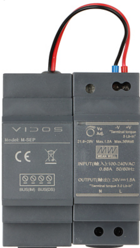
Rear panel (DIN rail installation):