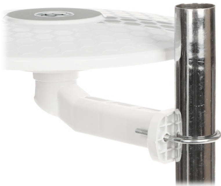
Fastening to horizontal surfaces: