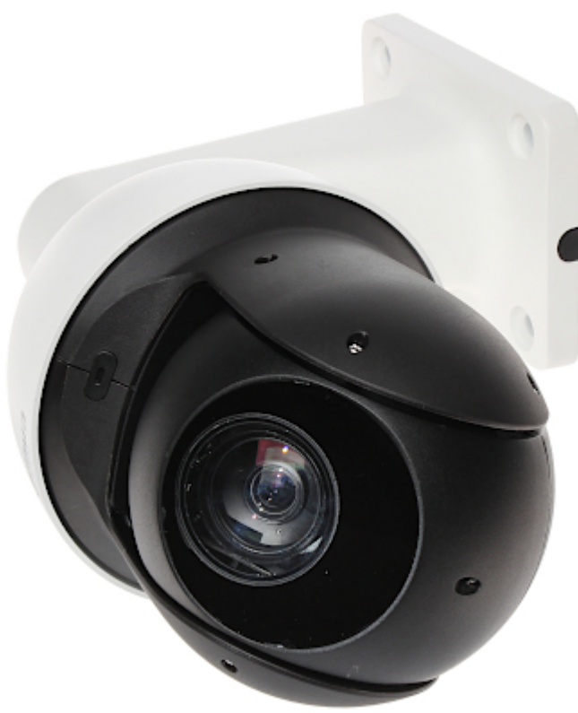
Micro SD card slot is located inside the camera:

Code: SD49225XA-HNR-S2 IP SPEED DOME CAMERA OUTDOOR SD49225XA-HNR-S2 - 1080p 4.8 ... 120 mm DAHUA