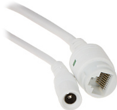
Power adapter included: