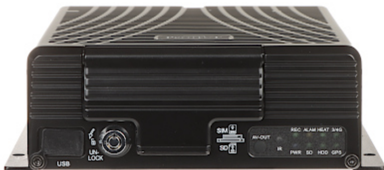
View after open the front cover: