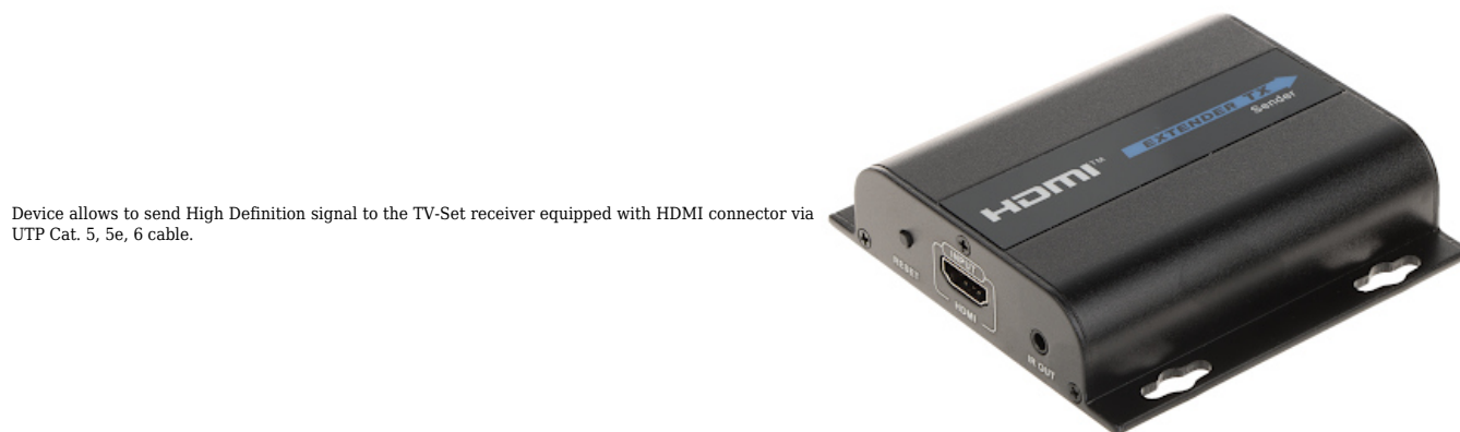
Device allows to send High Definition signal to the TV-Set receiver equipped with HDMI connector via UTP Cat. 5, 5e, 6 cable.

To return a worn-out product, use a collection and disposal system of this type of equipment or contact a seller from whom it was purchased. He will then be recycled in an environmentally-friendly way.