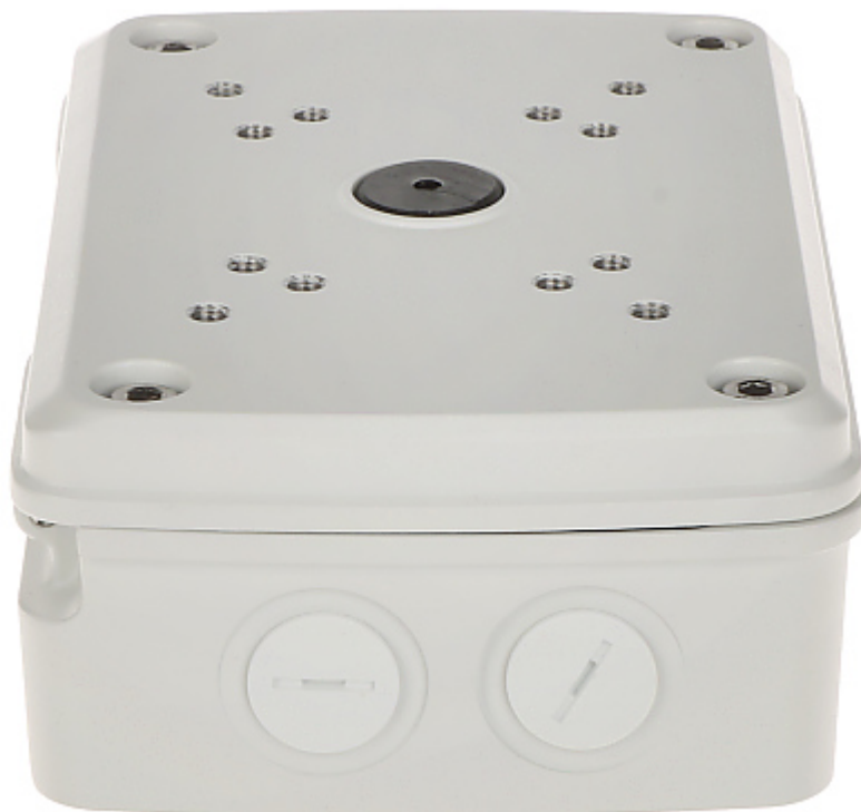
Wall mounting side view: