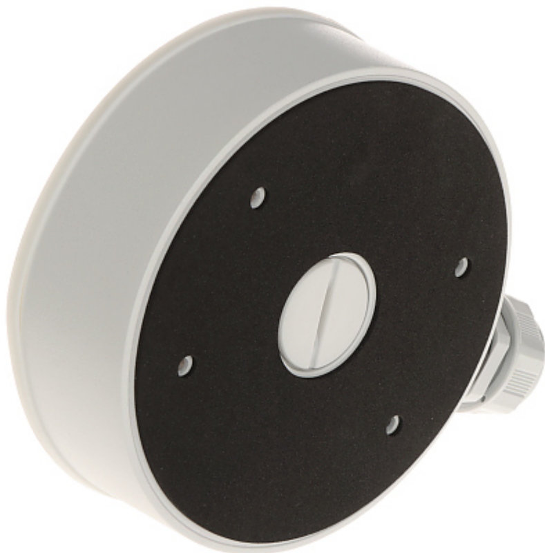
Wall mounting side view: