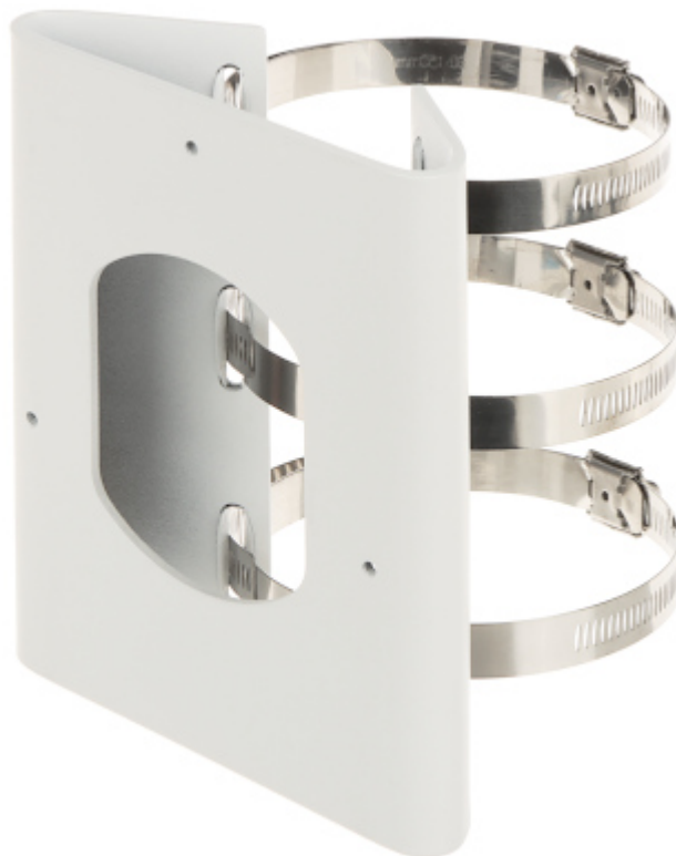
Mount designed to camera installation on a pole.

The device must be secured against contact with caustic, staining and viscous fluids.