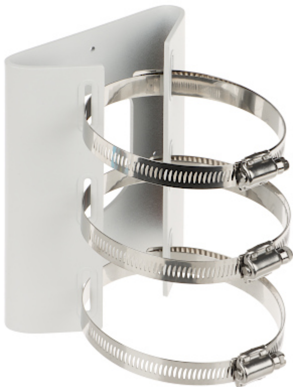
Example of application: