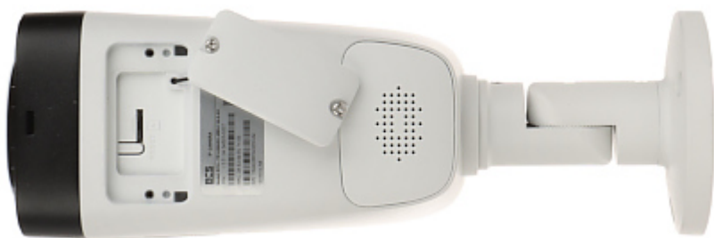
Memory card slot and "Reset" button: