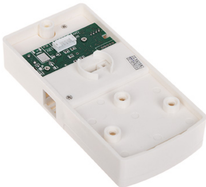
Emergency power supply module: