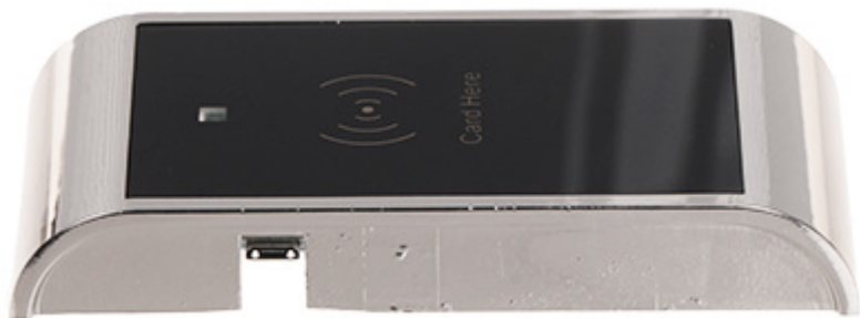
Door lock (strike):