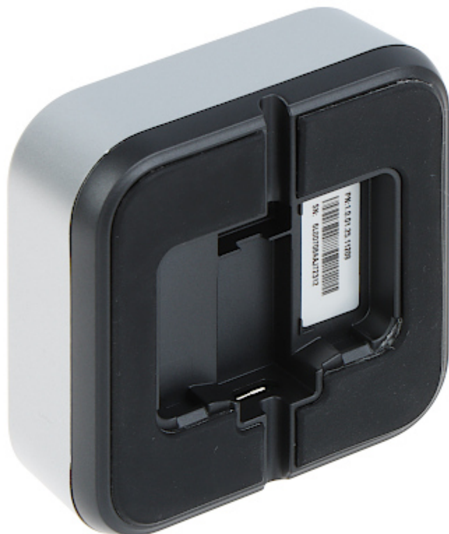
micro USB connector: