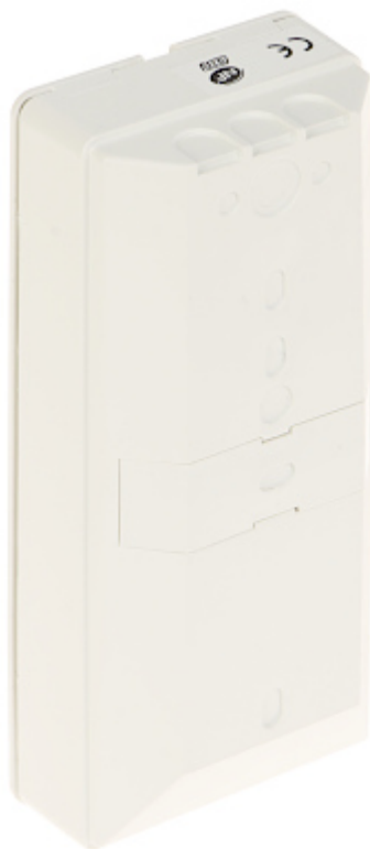
Detector inner view: