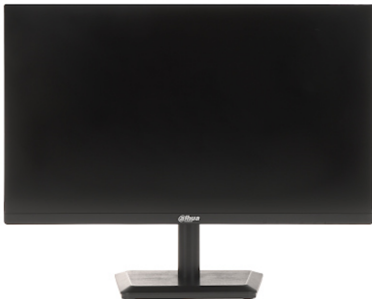
OSD menu control keys: