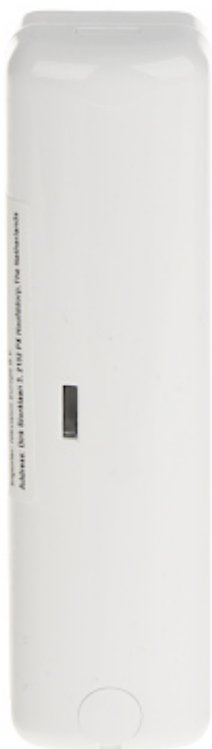
Internal view of the housing: