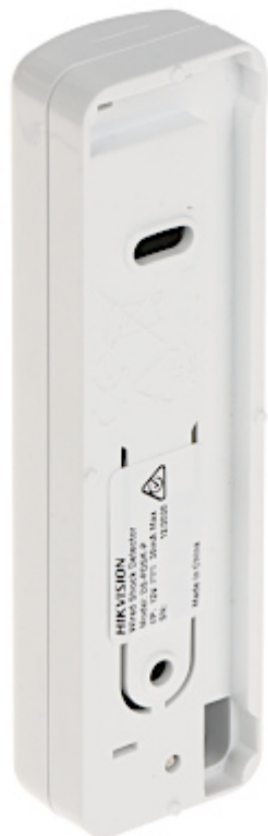
In the kit: