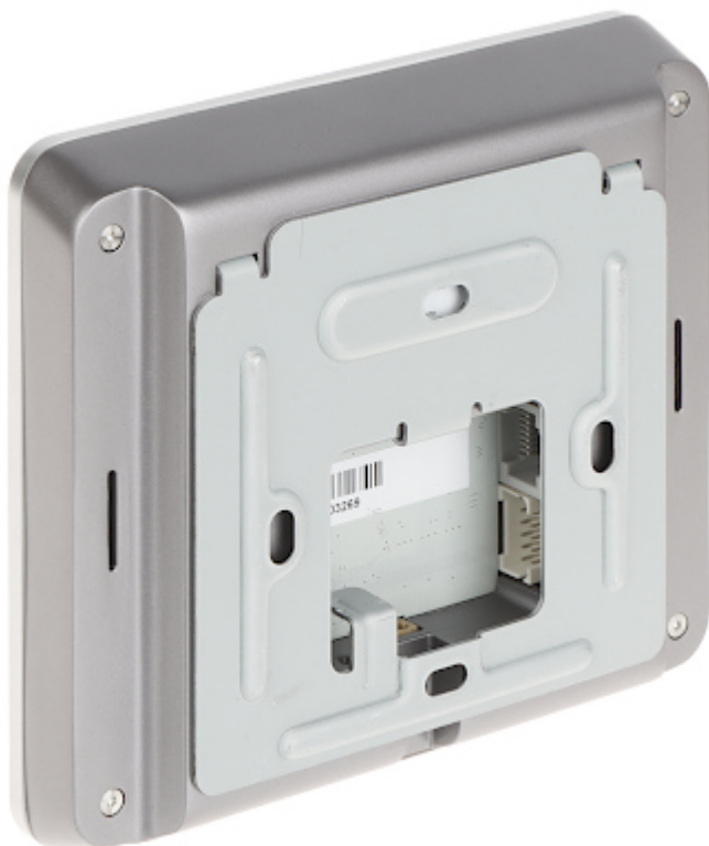
Rear view with desk stand attached: