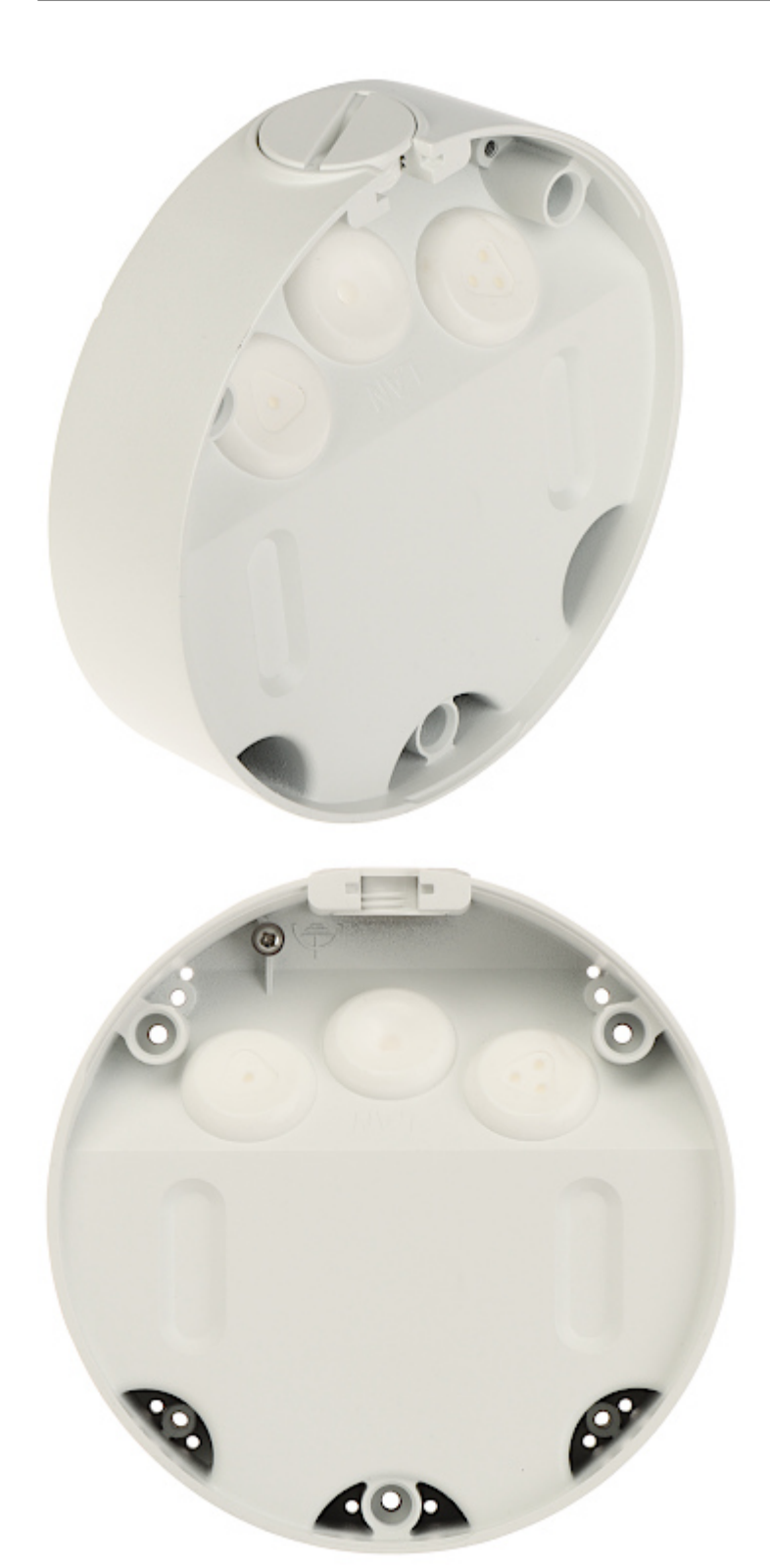
Camera and bracket dimensions:

Code: DS-2CD2686G2-IZS(2.8-12mm) IP VANDALPROOF CAMERA DS-2CD2686G2-IZS(2.8-12mm) - 8.3 Mpx - 4K UHD - MOTOZOOM Hikvision