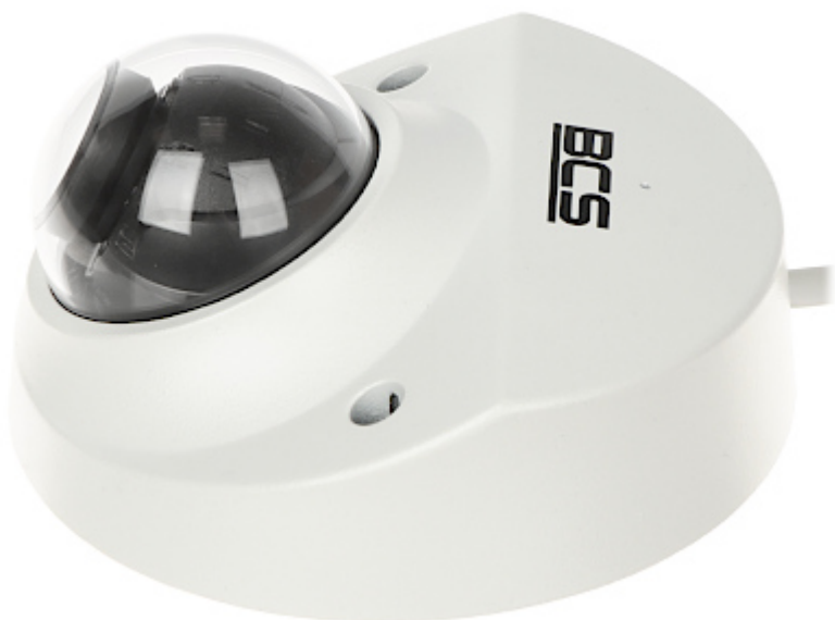
Camera view after remove the Dome cover: