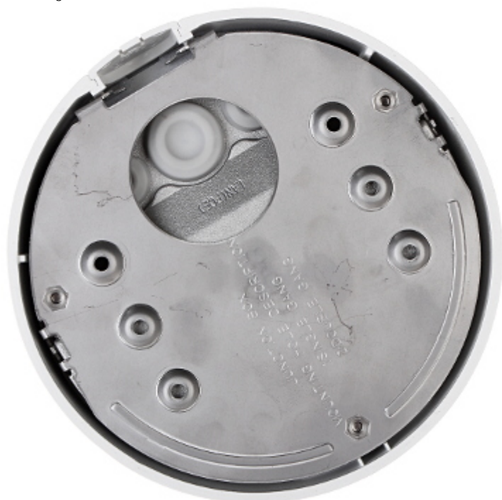
Bottom view (after remove the cover):