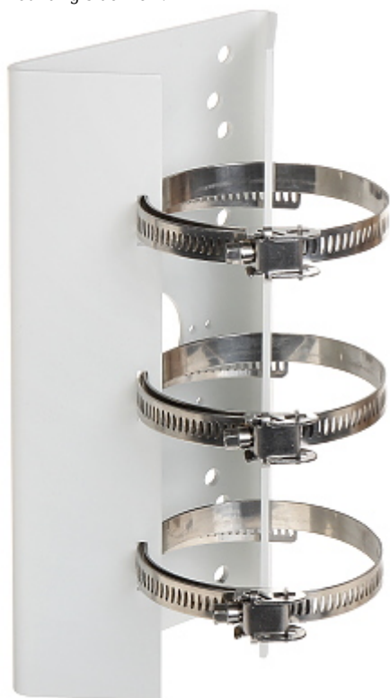
Example of application: