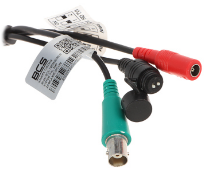
Standard changes are made using configuration switches:

\label{localizero} \textbf{Code: BCS-TQE6500IR3-B} \\ \textbf{AHD, HD-CVI, HD-TVI, PAL CAMERA BCS-TQE6500IR3-B} - 5 \\ \textbf{Mpx, } 3.3 \\ \dots \\ 12 \\ \textbf{mm}