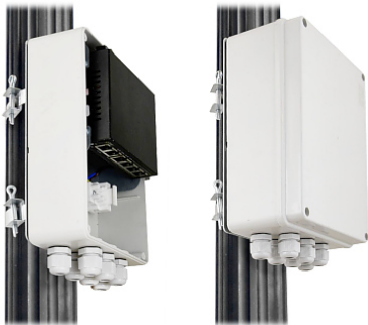
The correct mounting of the strip: