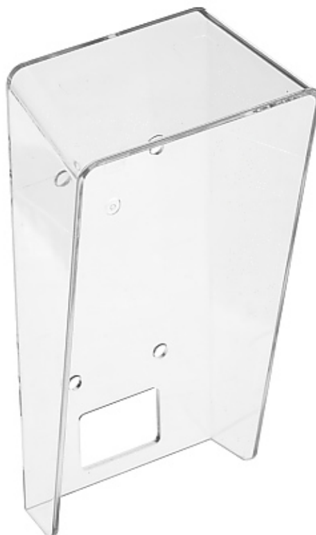
Surface-mounted Rain Cover designed for HIKVISION KV6103/6113 modular systems.

The device must be secured against contact with caustic, staining and viscous fluids.