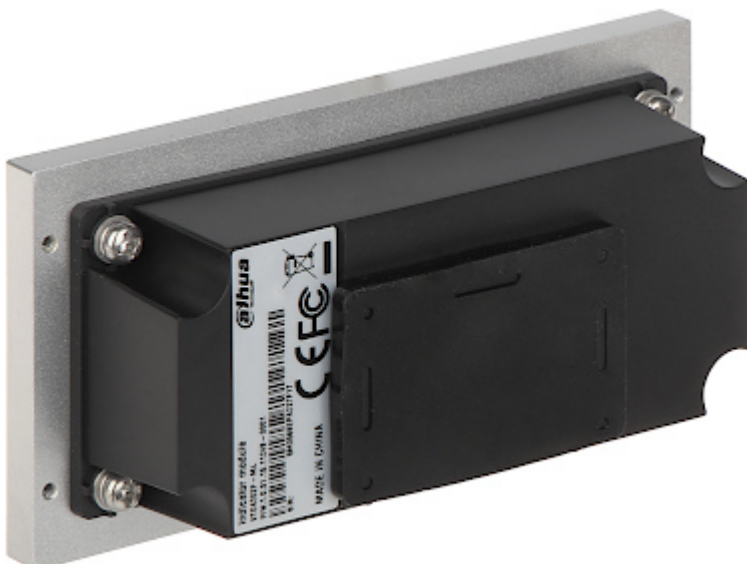
Internal view of the housing: