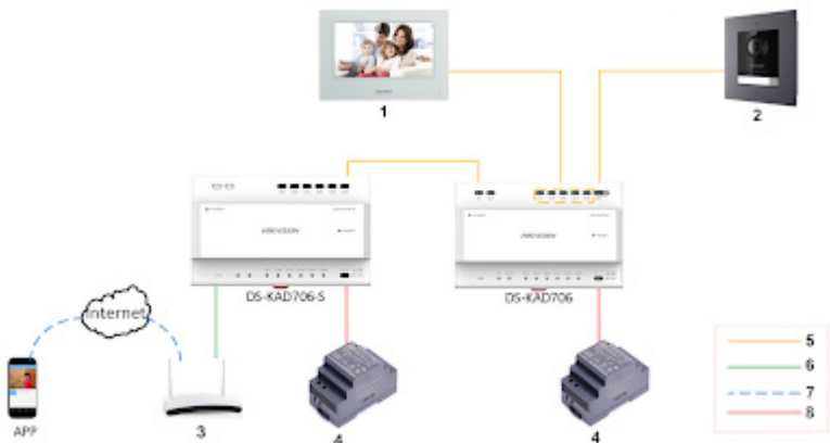
1. Indoor panel