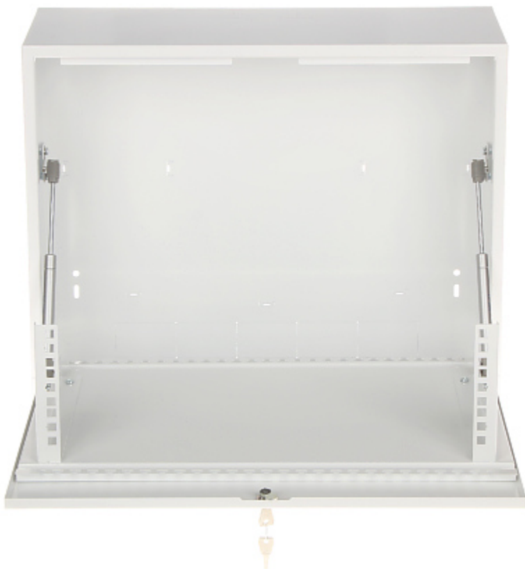
RACK 19" mounting rails: