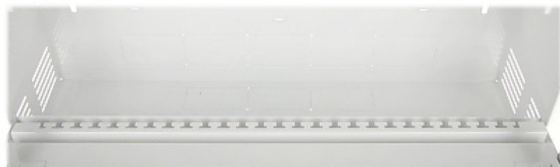
Holes for fan coolers: