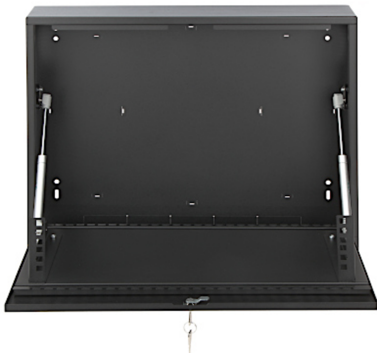
RACK 19" mounting rails: