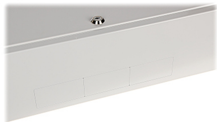
Holes for fan coolers: