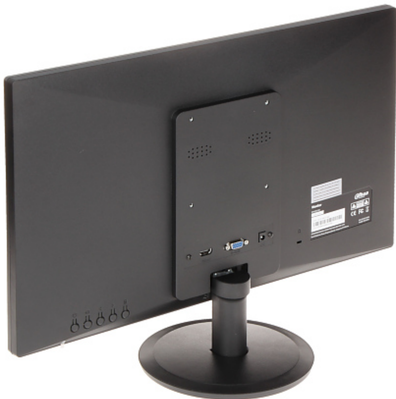
OSD menu control keys: