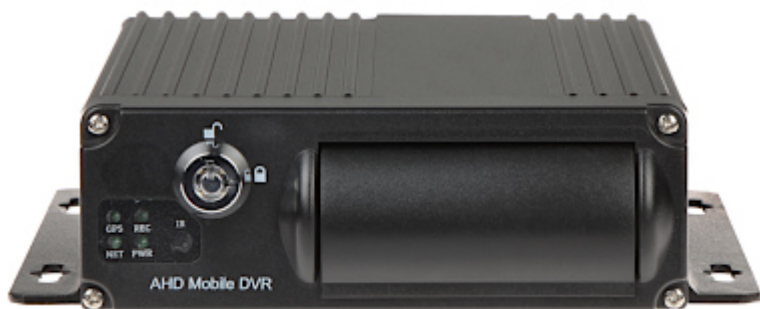
View after open the front cover: