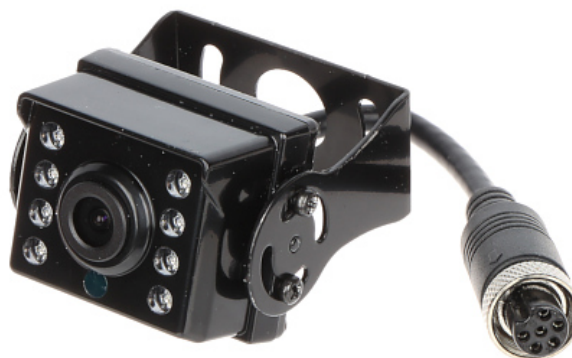
Mobile IP camera equipped with M12, 6-pin - code A connector, providing image in maximum resolution Full HD, 1080p.

To return a worn-out product, use a collection and disposal system of this type of equipment or contact a seller from whom it was purchased. He will then be recycled in an environmentally-friendly way.