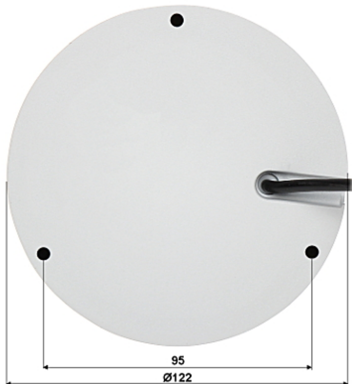
Standard changes are made using configuration switches: