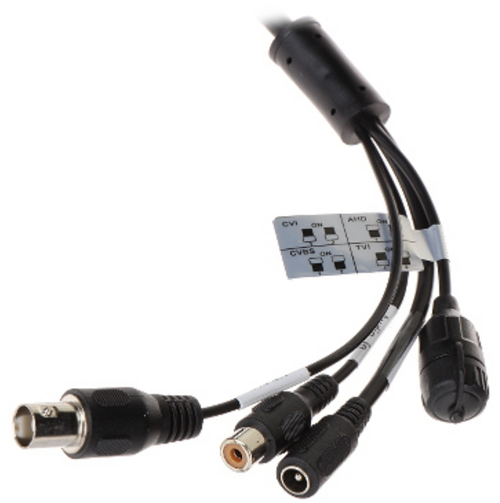
Standard changes are made using configuration switches: