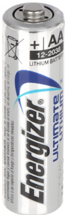
Comparison of Lithium and Alkaline batteries capacity: