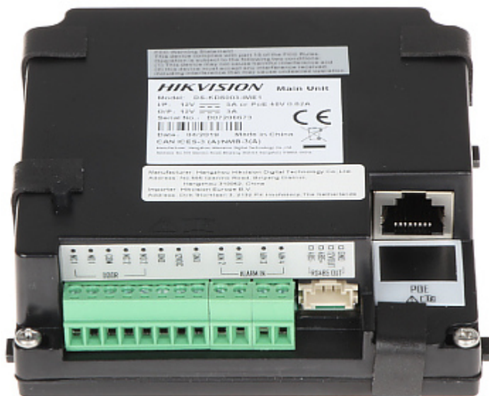
Device taken out from the housing: