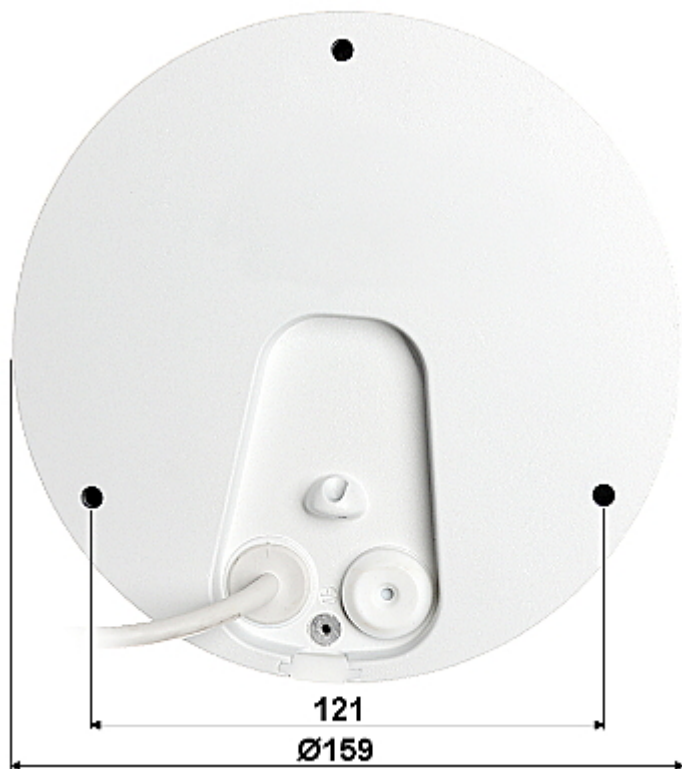
Camera with mounted bracket (bracket included):