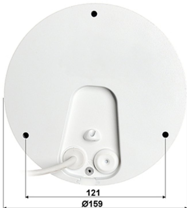
Camera with mounted bracket (bracket included):