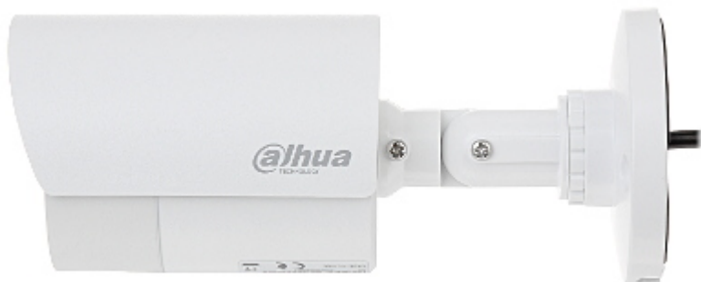
Camera mounting side view: