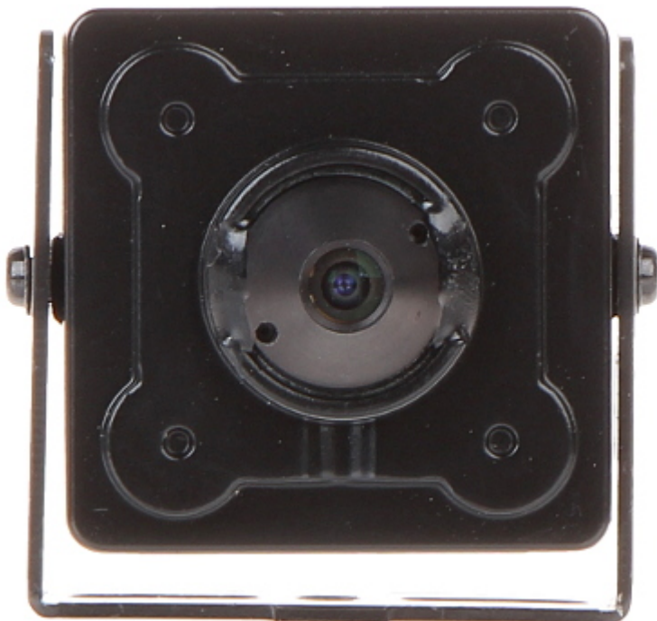
Camera is very small: