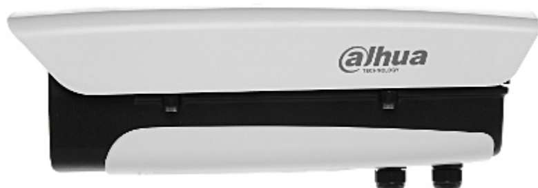
Internal view of the housing: