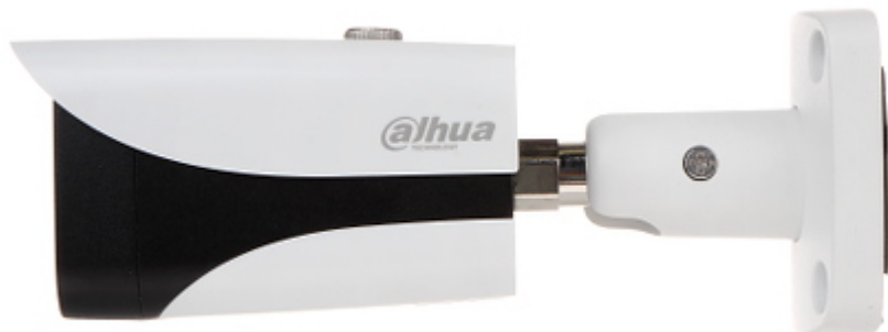
Camera mounting side view: