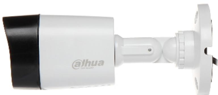
Camera mounting side view: