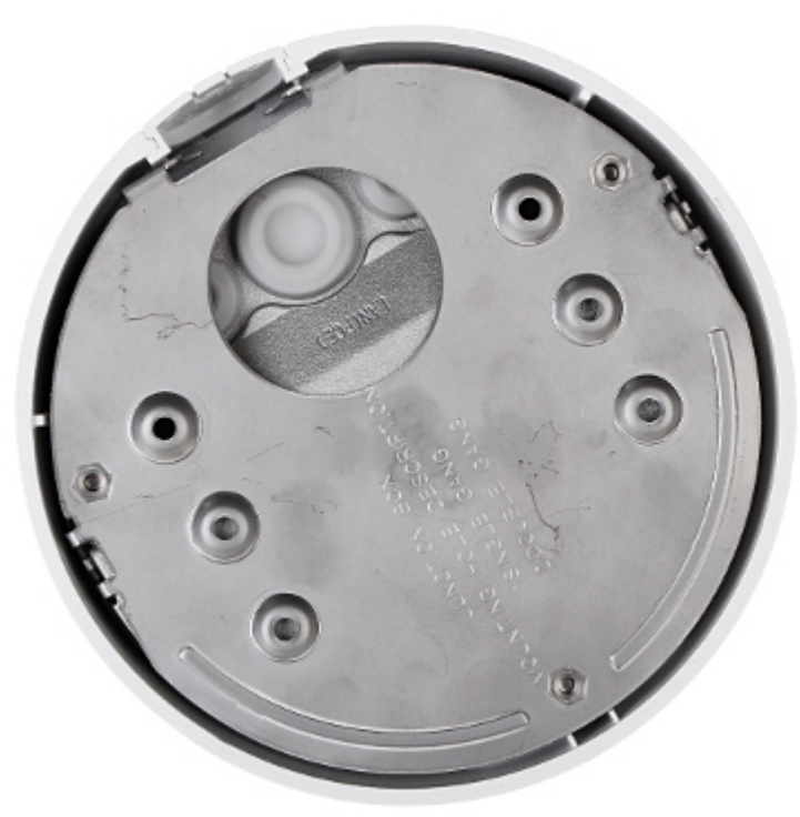
Bottom view (after remove the cover):

User Manual Code: DS-2CD2765FWD-IZS(2.8-12mm) IP VANDALPROOF CAMERA DS-2CD2765FWD-IZS(2.8-12mm) - 6.3 Mpx Hikvision