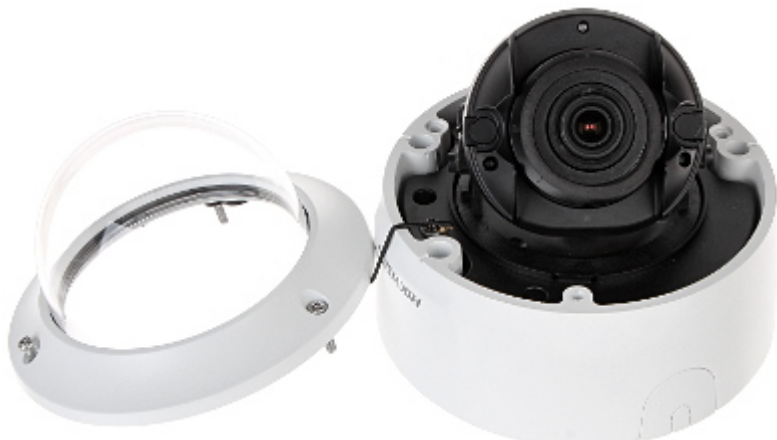
CVBS, SPOT output: