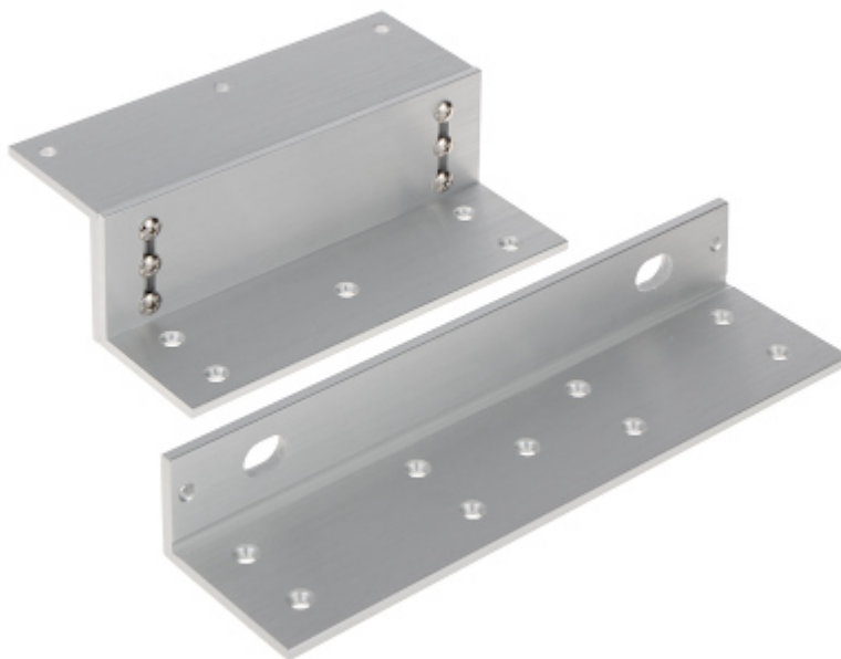
Z-bracket and L-bracket set for the ASF500A / ASF500B electromagnetic lock with load capacity of 500 kg.

The device must be secured against contact with caustic, staining and viscous fluids.