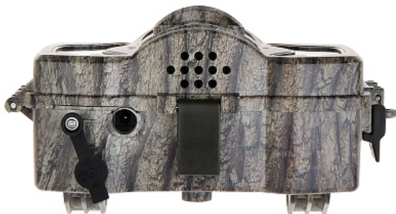
Device connectors are visible after remove the bottom cover: