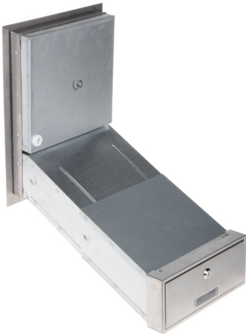
Front panel - view from the wall side: