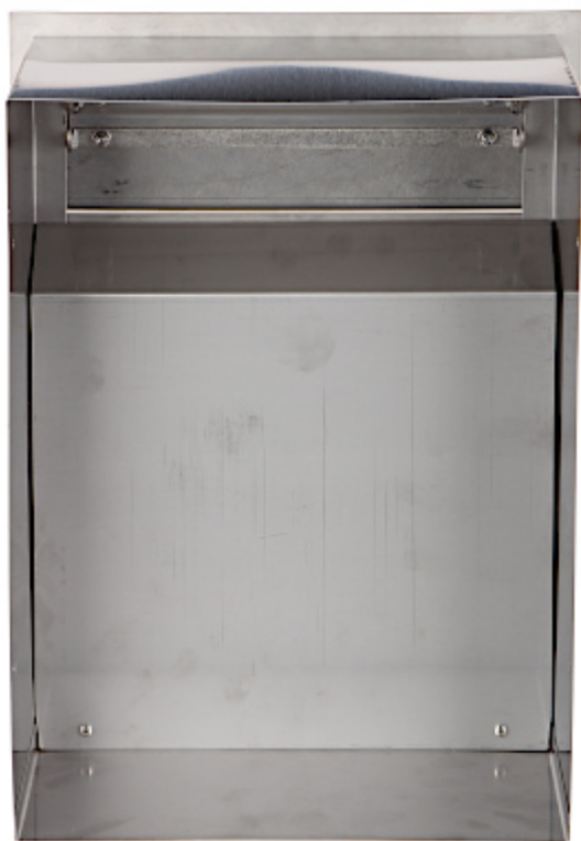
Front panel - view from the wall side: