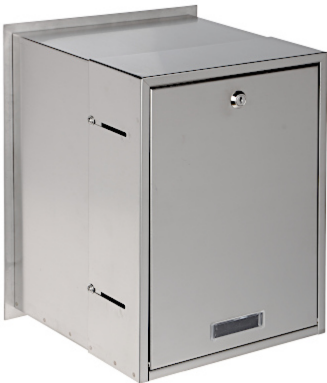
View after removing the back panel: