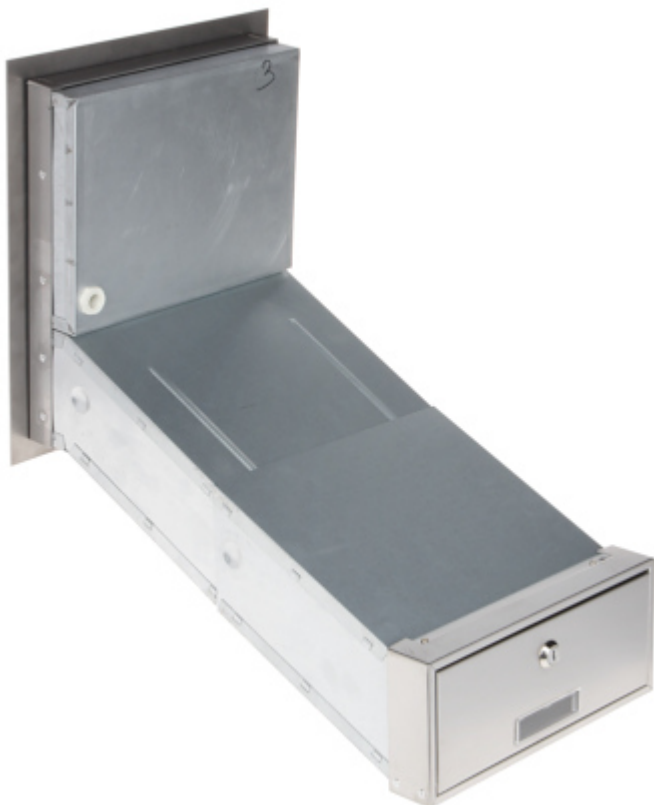
Front panel - view from the wall side: