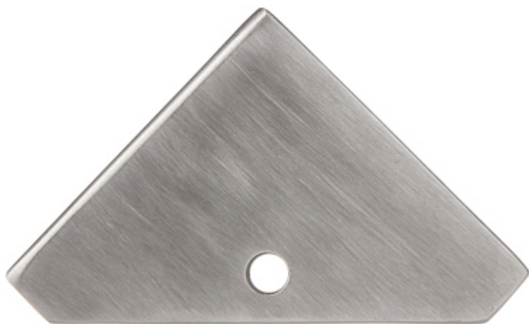
Wall mounting side view: