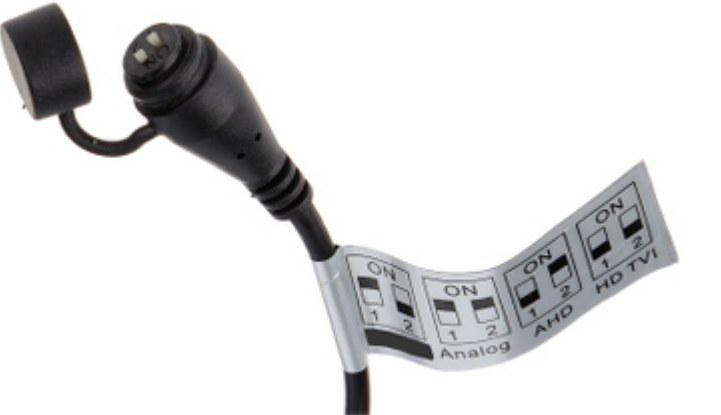
1. RS-485 (+) 2. RS-485 (-) Standard changes are made using configuration switches: